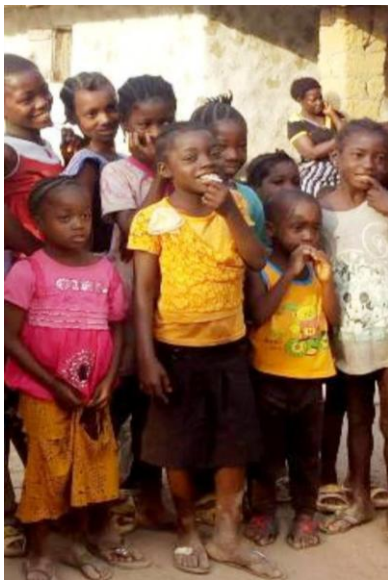
Village children living in poverty.