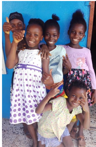
SIC Orphanage & Humanitarian Refuge Home's children living with provision.

Sponsor the Needy and Ensure Their Release from Poverty and Hopelessness to "Provision and Empowerment"